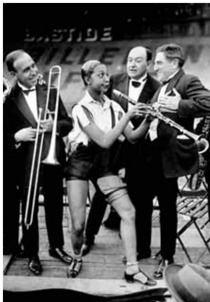
From top; Sidney Bechet, 1935; Caveau des Legendes jazz club; Josephine Baker, 1926

Paris offers dozens of jazz concerts nightly, in all kinds of styles. Pick up a copy of listings guide Lylo or visit www.lylo.fr to learn more. ➤